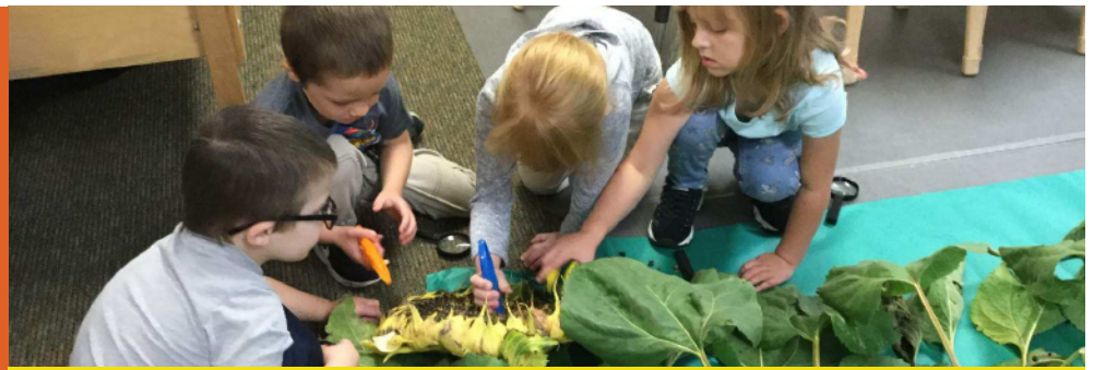
Grays Harbor, Mason, Thurston, Lewis, and Pacific (north) Counties