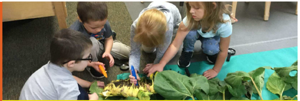
Grays Harbor, Mason, Thurston, Lewis, and Pacific (north) Counties